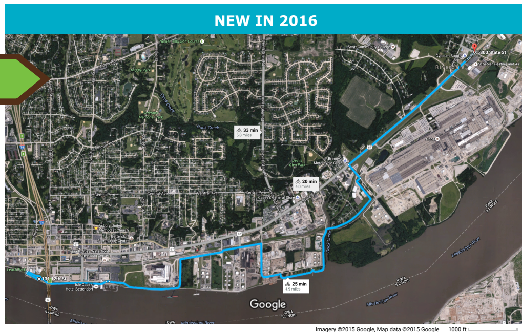
The Riverdale Trailhead is 1.9 miles from the Bettendorf Landing. Allow 25 minutes to bike one way.