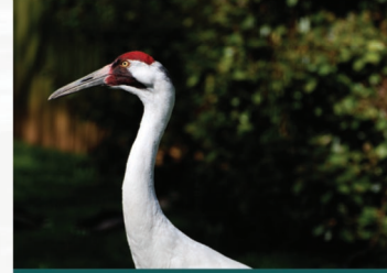
Whooping Crane ($10,000+)