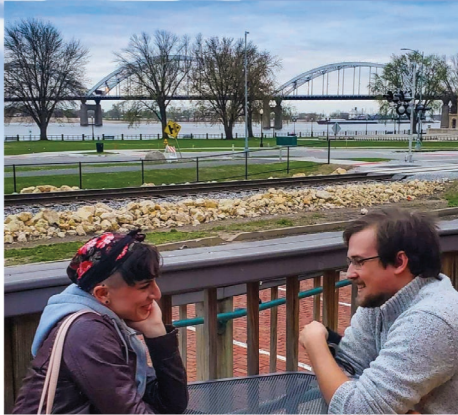
View from the outside deck of the Taste of Ethiopia.

A long the Davenport riverfront bike trail across from Le Claire Park is a well-appointed restaurant nestled next to Union Station. Taste of Ethiopia is a family restaurant run by George and Genet Moraetes that brings authentic and varied delights for any palate. The menu is divided into spicy, mild, and vegan-friendly foods and everything is made fresh, even the coffee is roasted in the restaurant, or outside in the summer.